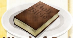
Word of God